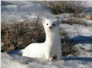
Long-Tailed Weasel, FCPP

Wed Jan 20: Mt. Edziza and the Spectrum Range