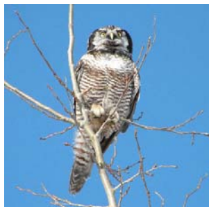
Northern Hawk Owl

CFNS & Inglewood 24hr Rare Bird Alert 403-221-4519 Updated Mon & Thu