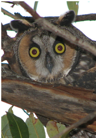
Long-eared Owl, ©Anne K. Elliot